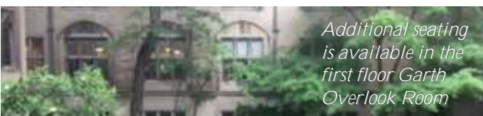
Additional seating is available in the first floor Garth Overlook Room