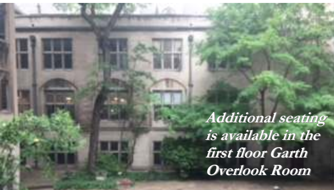
Additional seating is available in the first floor Garth Overlook Room