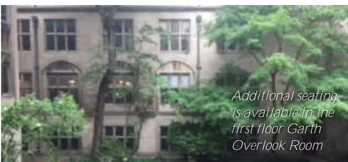
Additional seating is available in the first floor Garth Overlook Room