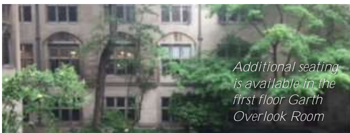
Additional seating is available in the first floor Garth Overlook Room