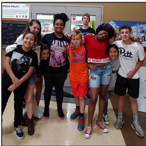
In July, the Middle School Mission Trip Team enjoyed serving at World Vision and at Crestfield Camp, as well as learning about environmental sustainability at Slippery Rock University.