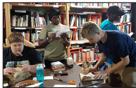
The Senior High Mission Trip Team spent a week in August selecting books to send to folks who were incarcerated, serving lunch at Northside Common Ministries and dinner at First Presbyterian Church, and preparing a meal for families at Ronald McDonald House.