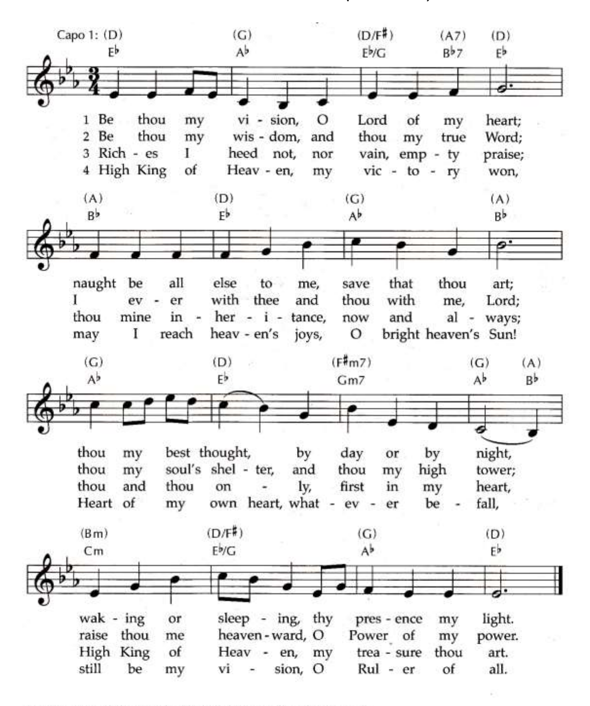
Guitar chords do not correspond with keyboard harmony.

These stanzas are selected from a 20th-century English poetic version of an Irish monastic prayer dating to the 10th century or before. They are set to an Irish folk melody that has proved popular and easily sung despite its lack of repetition and its wide range.