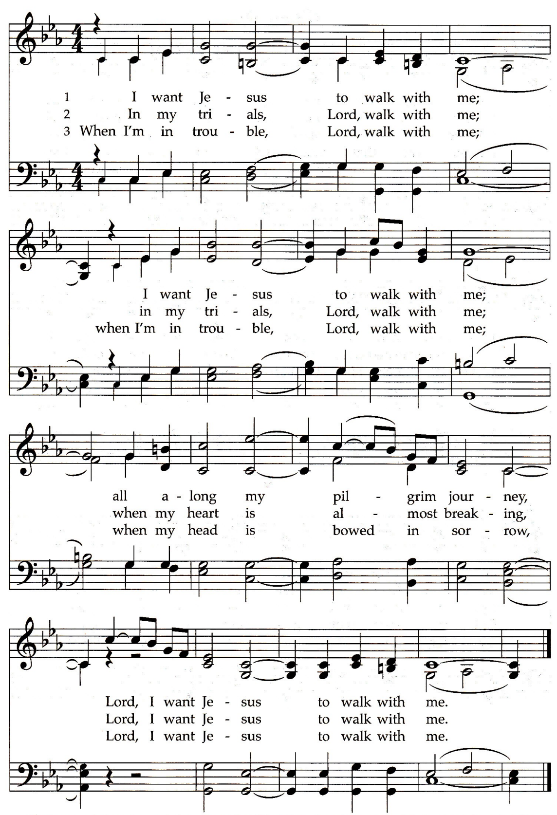
The two equal phrases in each line suggest that this African American spiritual shares some characteristics of work or field songs that were used to coordinate the efforts of slaves involved in tasks (road clearing, ditch digging, etc.) that needed combined rhythmic strokes.