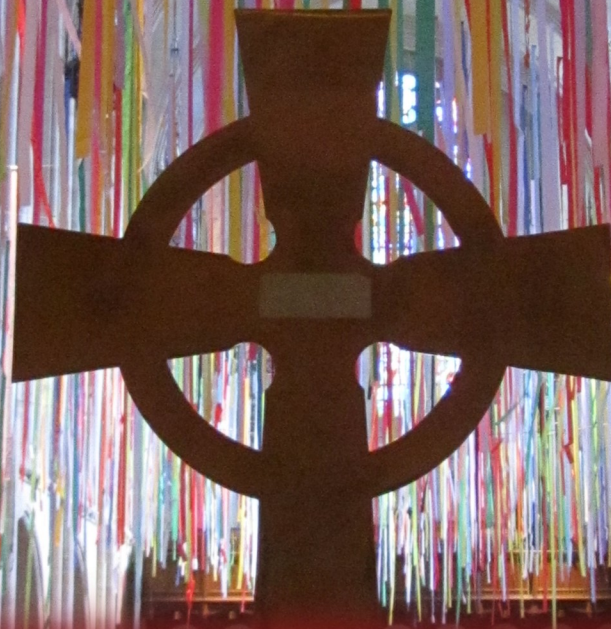
Image of Sanctuary from Pentecost 2012

11am Sanctuary Worship Pentecost Sunday, May 23, 2021