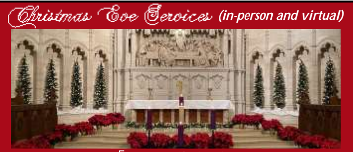
5 pm Family Service 10 pm Candlelight Service (music begins at 9:30 pm)

Grades 6 through 12 — Play Yard (facing Baum Boulevard)