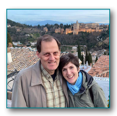
Rejoice! May the God of Peace Se with you. —Philippians 4:4-7

We will miss seeing you in person, but trust you'll be back in the pews on Sun., May 8, as we ordain and install our incoming class of ELPC officers.