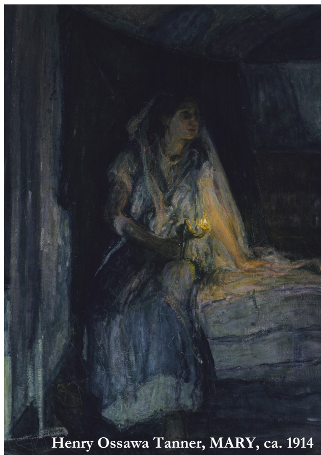
Henry Ossawa Tanner, MARY, ca. 1914