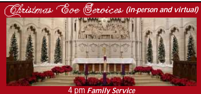
4 pm Family Service 10 pm Candlelight Service (music begins at 9:30 pm)