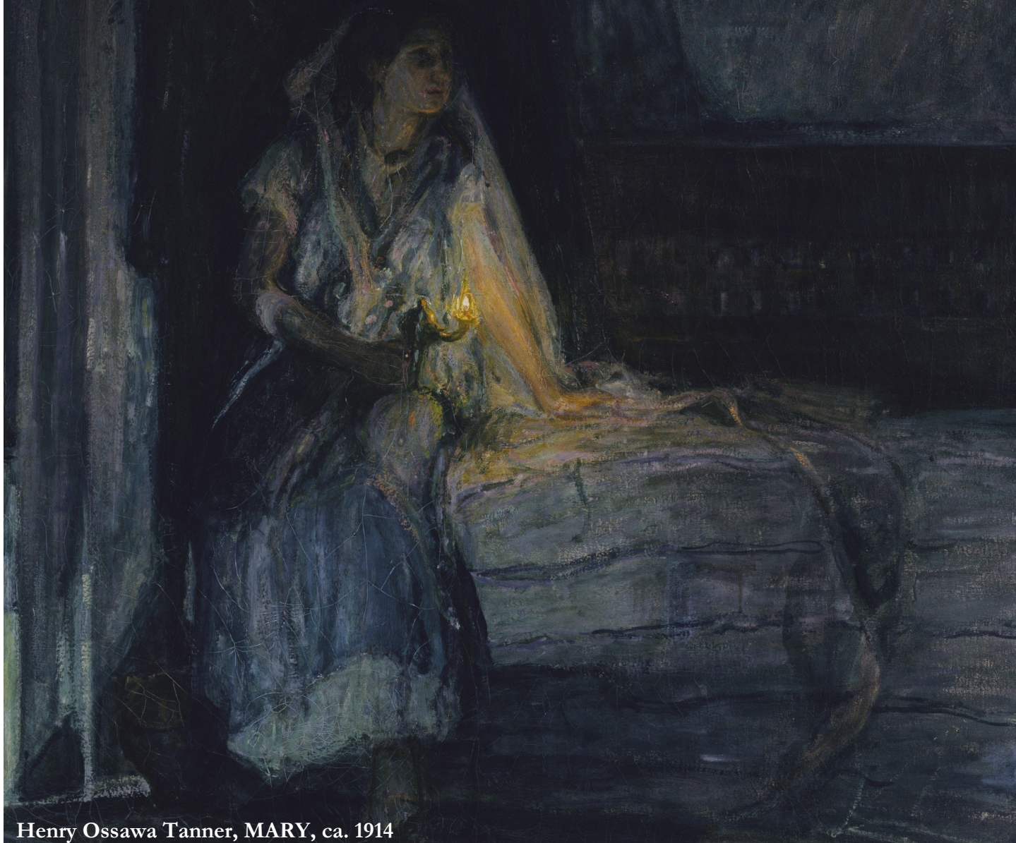
Henry Ossawa Tanner, MARY, ca. 1914