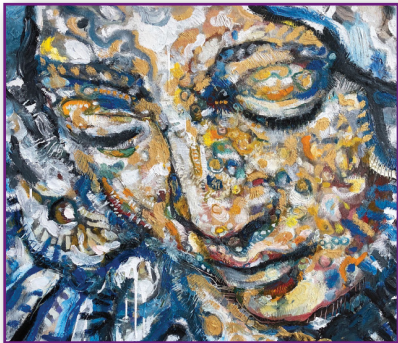
Adoration, Daniel Bonnell

March 8 is International Women's Day—a day to celebrate the gifts of women and to name the inequities experienced by women across the globe.