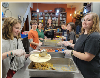
Youth Group recently served dinner at Hot Metal Faith Community.