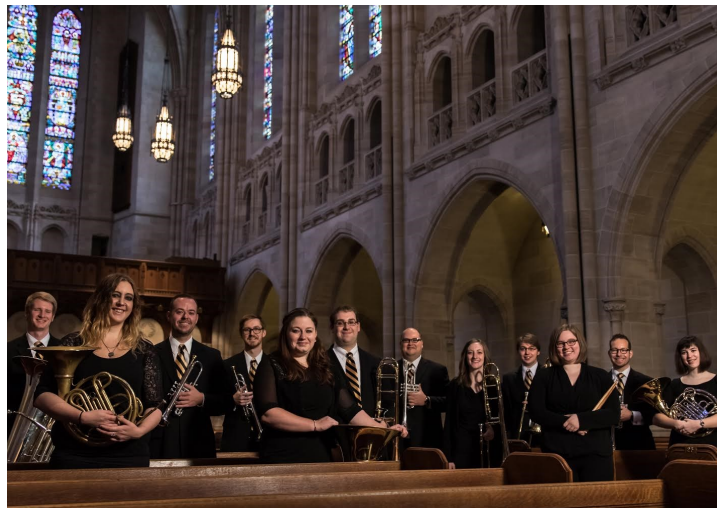
THE BRASS ROOTS