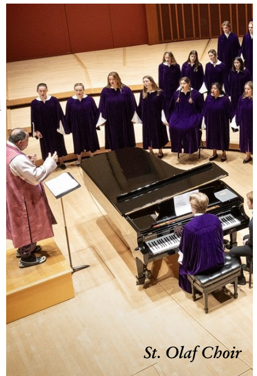
St. Olaf Choir