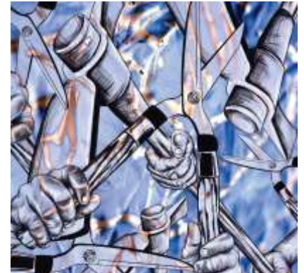
War No More by Lisle Gwynn Garrity

DECEMBER 8, 2024 11 AM SANCTUARY WORSHIP