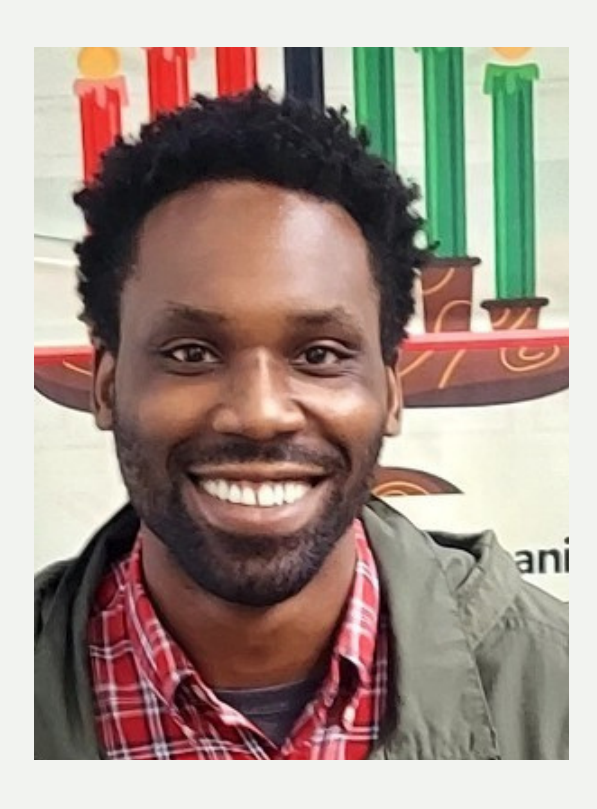
Occupation: Director of Operations & Technology

My vision for ELPC is the same vision it has for itself which is a growing, inclusive community that reflects Christ's love by creating a large tent for people of all backgrounds. I see the church as a place where individuals come together to address systemic challenges through shared values and collective action. By fostering respectful dialogue, repairing harm, and leaning into God's guidance, the church can create a meaningful impact in the world. I hope to support ELPC in its mission to build bridges, embrace diversity, and engage with justice-focused work that uplifts the community and beyond.